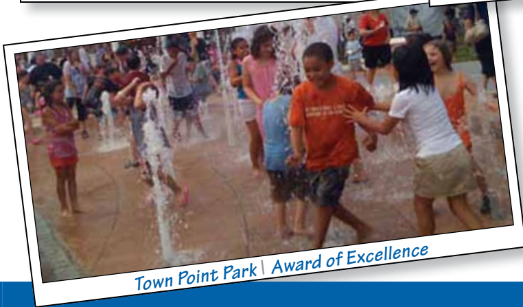
Town Point Park | Award of Excellence

“To identify and encourage excellence in development in the Hampton Roads real estate community.” HRACRE Excellence in Development Design Awards Program Committee Mission Statement