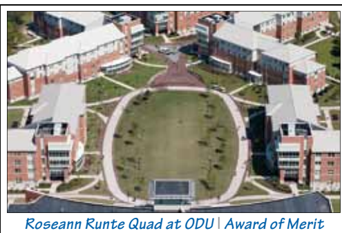
Roseann Runte Quad at ODU | Award of Merit

Our apologies to VHB for not including them as the Civil Engineer for the Roseann Runte Quad at ODU project, which won an Award of Merit.