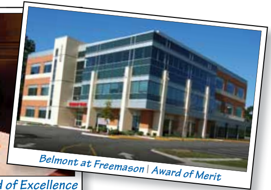
Belmont at Freemason | Award of Merit