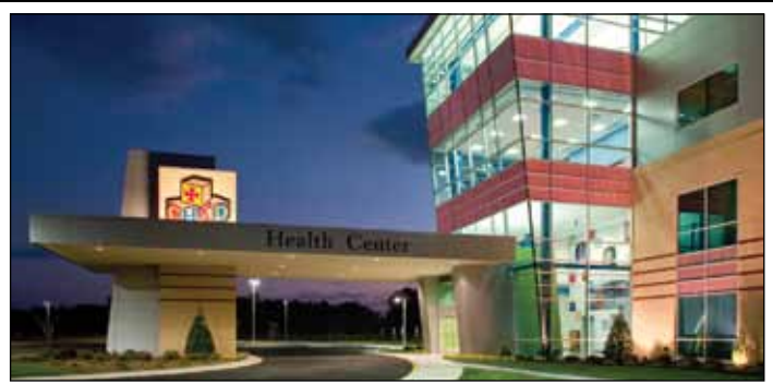
CHKD Health Center at Oakbrooke | Award of Excellence