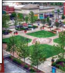
Peninsula Town Center | Award of Merit