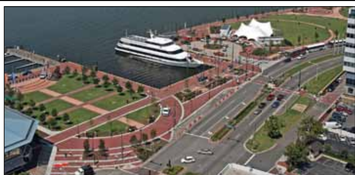
Town Point Park | Award of Excellence