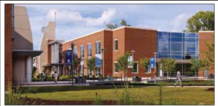
TCC: New Portsmouth Campus | Award of Excellence