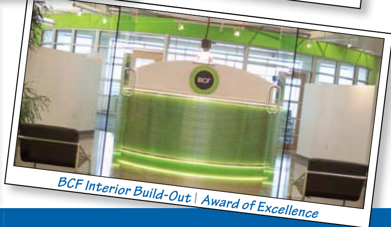
BCF Interior Build-Out | Award of Excellence