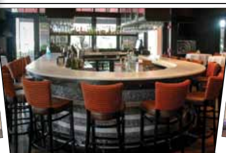
Bensi @ Peninsula Town Center | Award of Merit