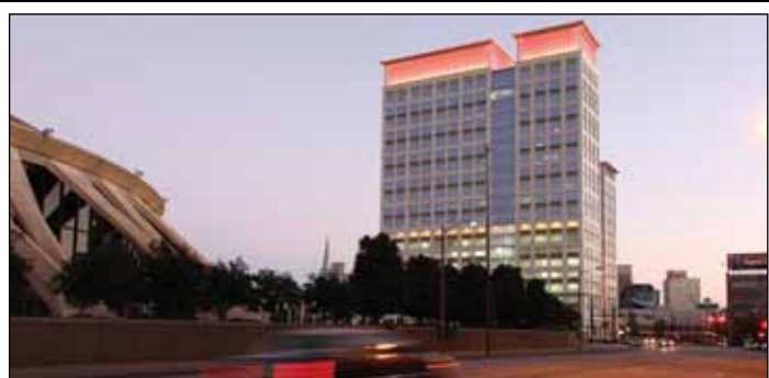
Wells Fargo | Award of Excellence