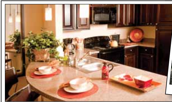
The District at Old Dominion University | Award of Excellence