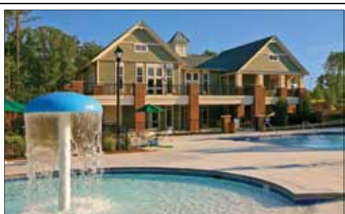
Stonehouse Rec. Cntr @ Laurel Grove Park | Award of Merit