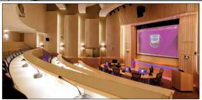
Joint Deployment & Maritime Op. Cntr. | Award of Excellence