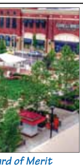
ard of Merit