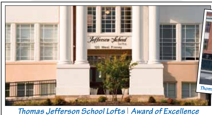
Thomas Jefferson School Lofts | Award of Excellence