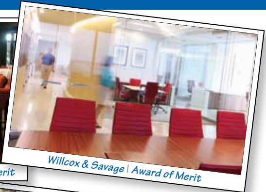
Willcox & Savage | Award of Merit