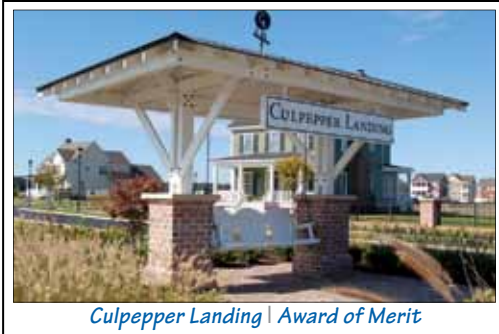
Culpepper Landing | Award of Merit