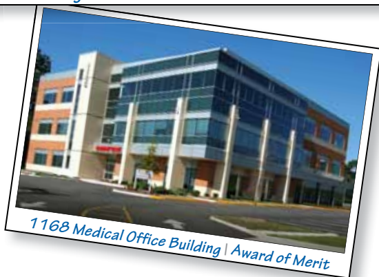
1168 Medical Office Building | Award of Merit