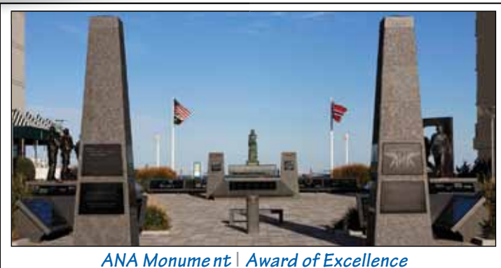
ANA Monument | Award of Excellence