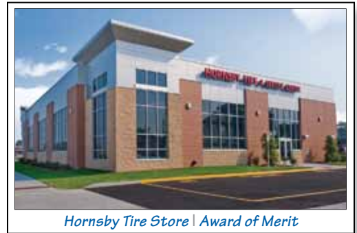
Hornsby Tire Store | Award of Merit