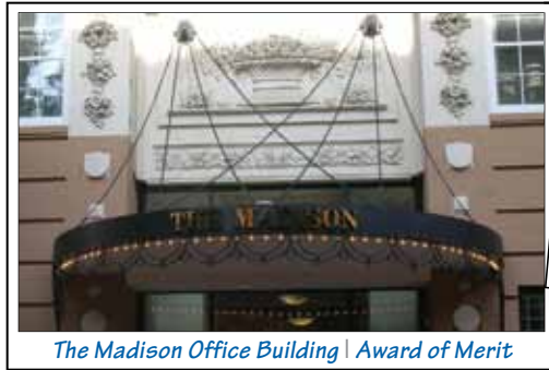
The Madison Office Building | Award of Merit