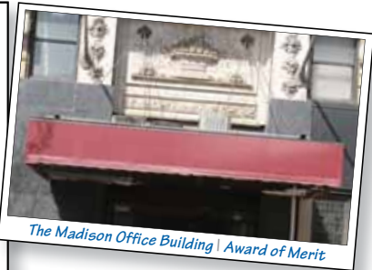
The Madison Office Building | Award of Merit