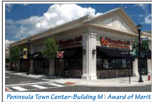
Peninsula Town Center-Building M | Award of Merit