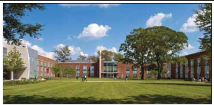
TCC: Main Administration Building A | Award of Excellence